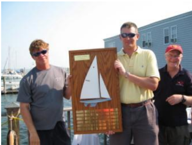
Winners of the First Race