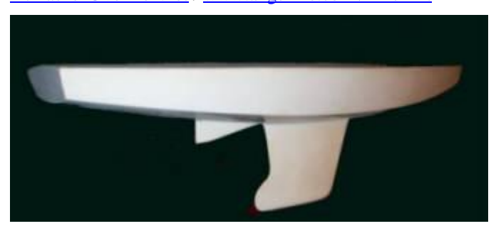
EARLY STARLIGHTS From December 1923 through January 1924

Milton Thrasher: 941 966-9172 mthrasher@verizon.net / www.angelfire.com / fl4 / mft