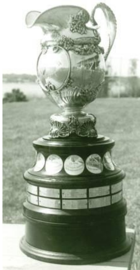
Bedford Pitcher 100 years old in 2005

The trophy base contains the names of many well known Star skippers, with room for more.