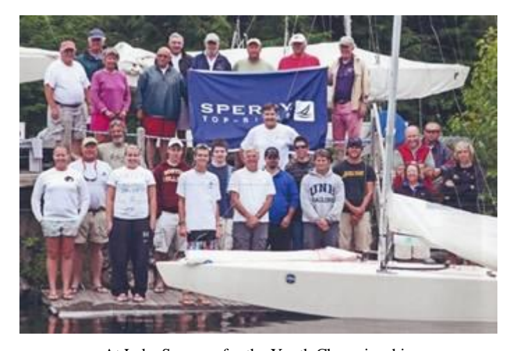
At Lake Sunapee for the Youth Championship