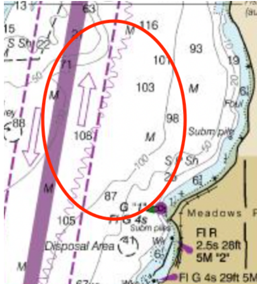
Figure 1: Puget Sound, Shilshole Bay Marina, Meadow Point