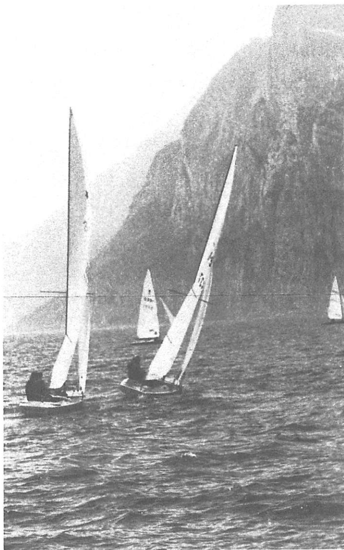
1973 European Spring Silver Star, at Malcesine, Lago di Garda.

When the wind squall struck, the combination of the bull-ring vang in a fairly tight condition and the curved cockpit coaming caused the boat to swamp when the mainsail would not ease.